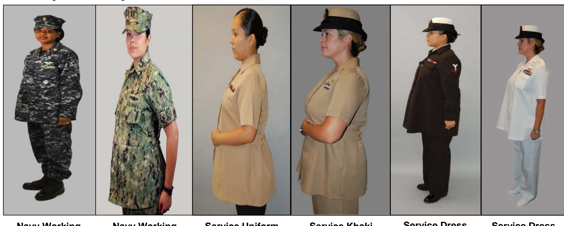
Navy Working Uniform (NWU Type I)