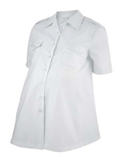
Current Dress/Summer White Design