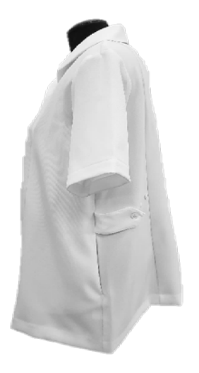
Improved Dress/Summer White Design